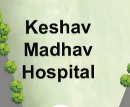
Keshav Madhav Hospital